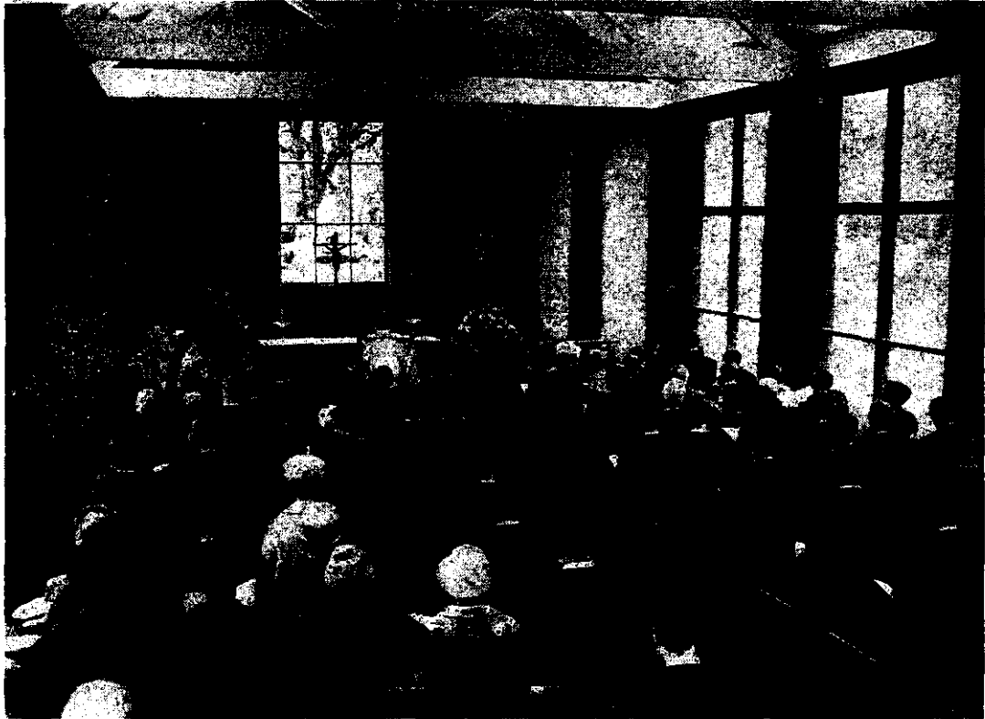
FIG. 1—THE SALUTATION BY THE CHAPLAIN OF THE FLEET BEFORE THE DEDICATION OF THE CHURCH OF ST. JOHN AND ST. JAMES AT THE R.N. ENGINEERING COLLEGE, MANADON