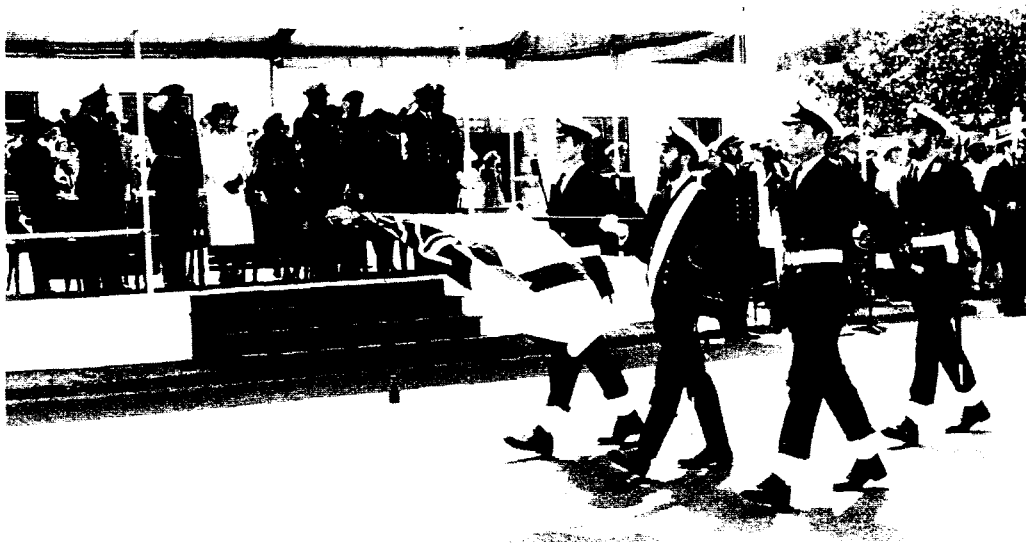
FIG. 1—MARCH PAST OF THE QUEEN'S COLOUR AT LORD HIGH ADMIRAL'S DIVISIONS