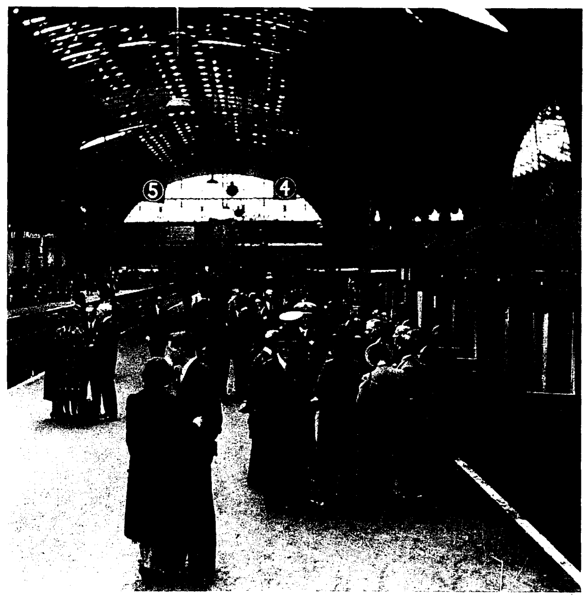
Fig. 2—Naval and civilian personnel of the Admiralty on the platform at Paddington before leaving for Bath on 17 September 1939