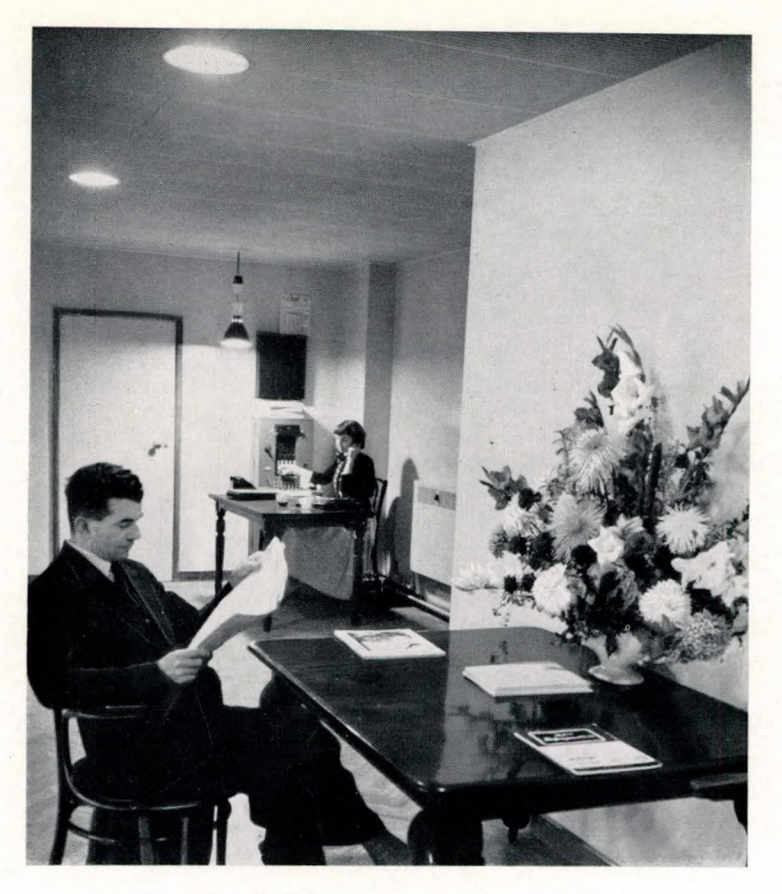
Reception Hall leading to the General Office