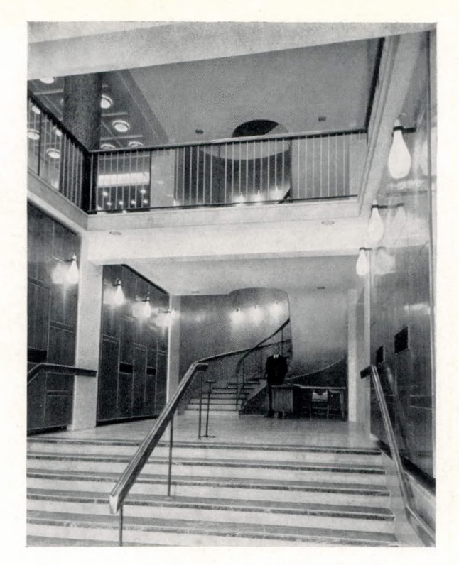
The Entrance Hall