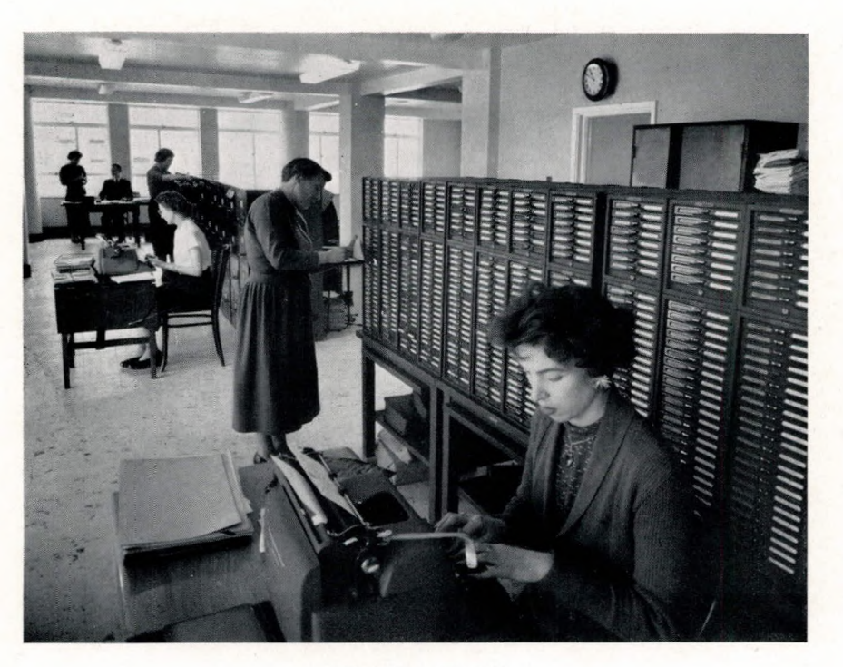
The General Office