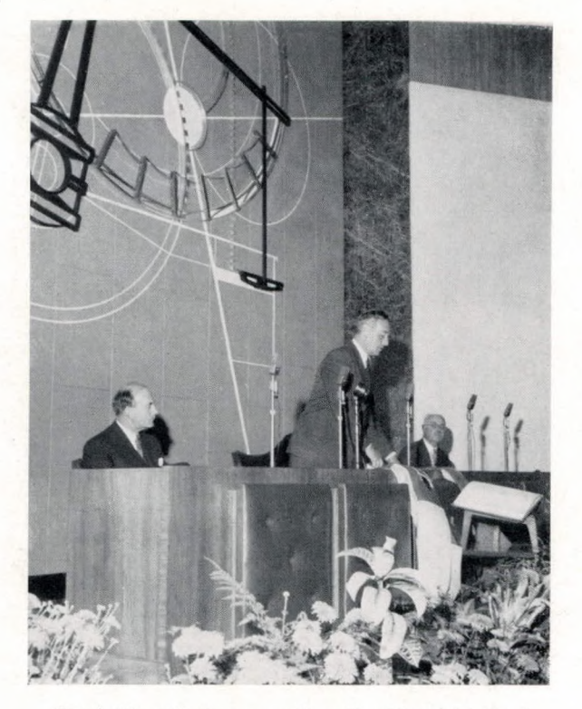
Lord Mountbatten unveiling the Memorial Book