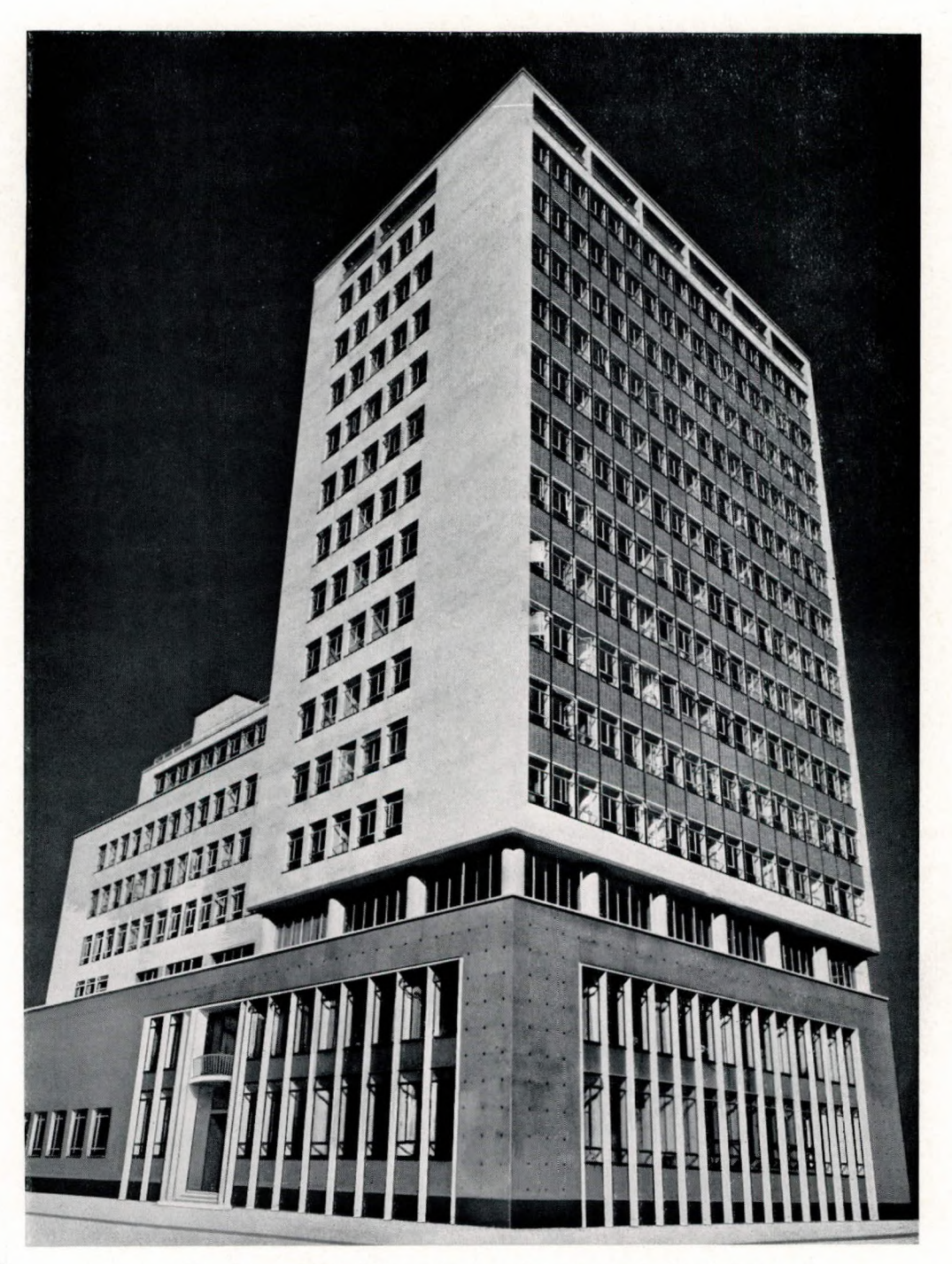
The Memorial Building: showing the entrance in Mark Lane