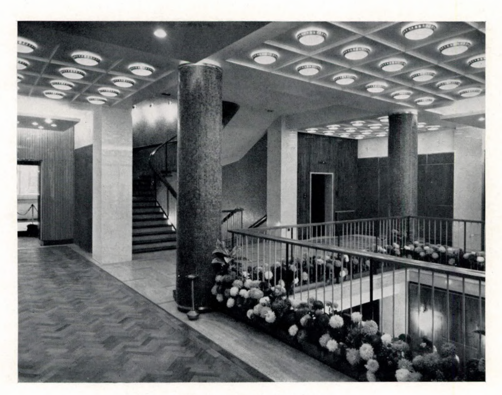
The foyer on the first floor