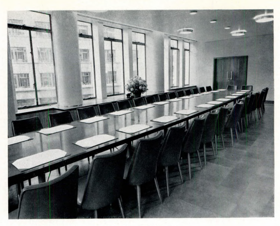
The Council Chamber