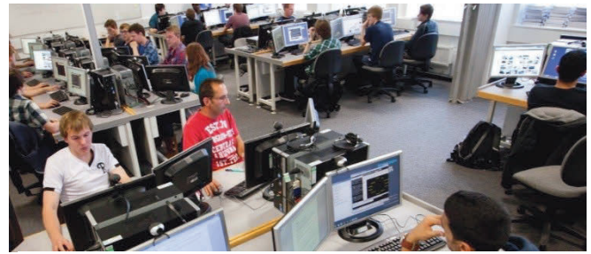
Figure 3: UoP cyber-range

It is important to recognise that, although researching maritime cybersecurity is crucial, it is not currently an easy area of research. As maritime cyber data is scarce, commercially sensitive, or