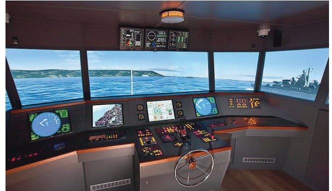
Figure 4: UoP ship simulator (bottom)

pertains to national security, and the equipment necessary to represent shipping environments is much more expensive than more traditional security labs, it may be overlooked as a research field. Providing a space where government industry and academia can pool resources and research efforts will be of significant benefit to all those involved with maritime. While this maritime-cyber lab aims to provide next generation research capabilities, it is not intended as a stand-alone solution. As seen in Figure 1, the Cyber-SHIP lab is meant to be integrated with other existing facilities. In this case, the lab is able to connect to other UoP facilities, including its cyber-range and ship's bridge simulator (Figures 3 and 4 respectively).