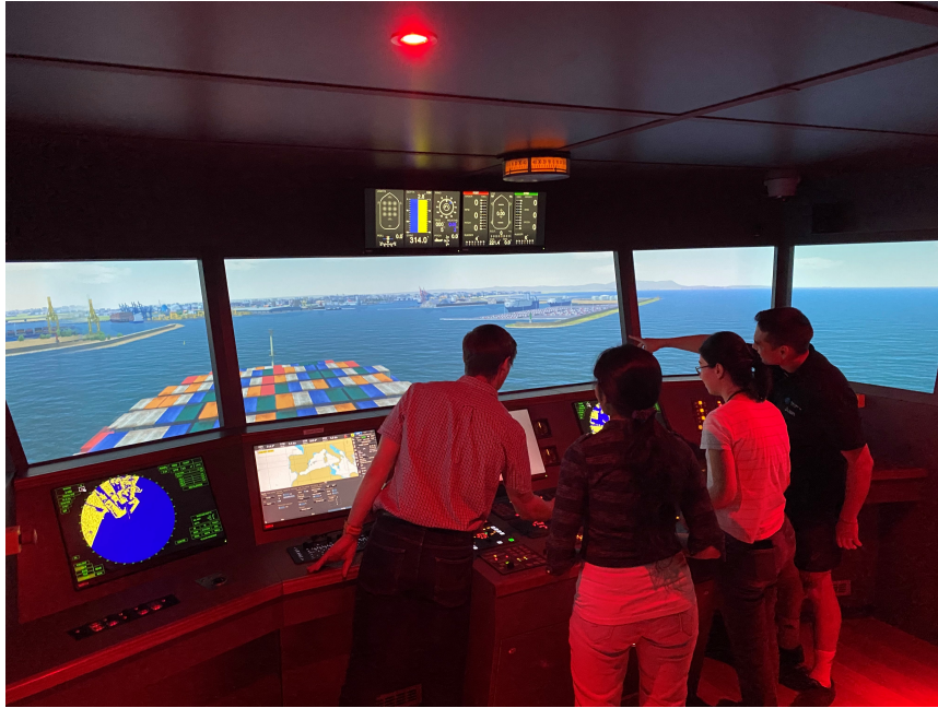
Figure 3: One group of participants in the full bridge simulator