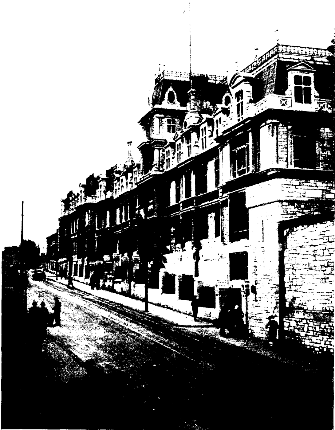
FIG. 1—ROYAL NAVAL ENGINEERING COLLEGE, KEYHAM