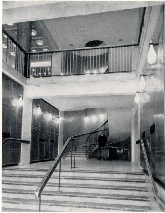
The Entrance Hall