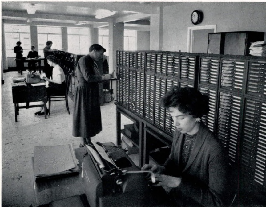
The General Office