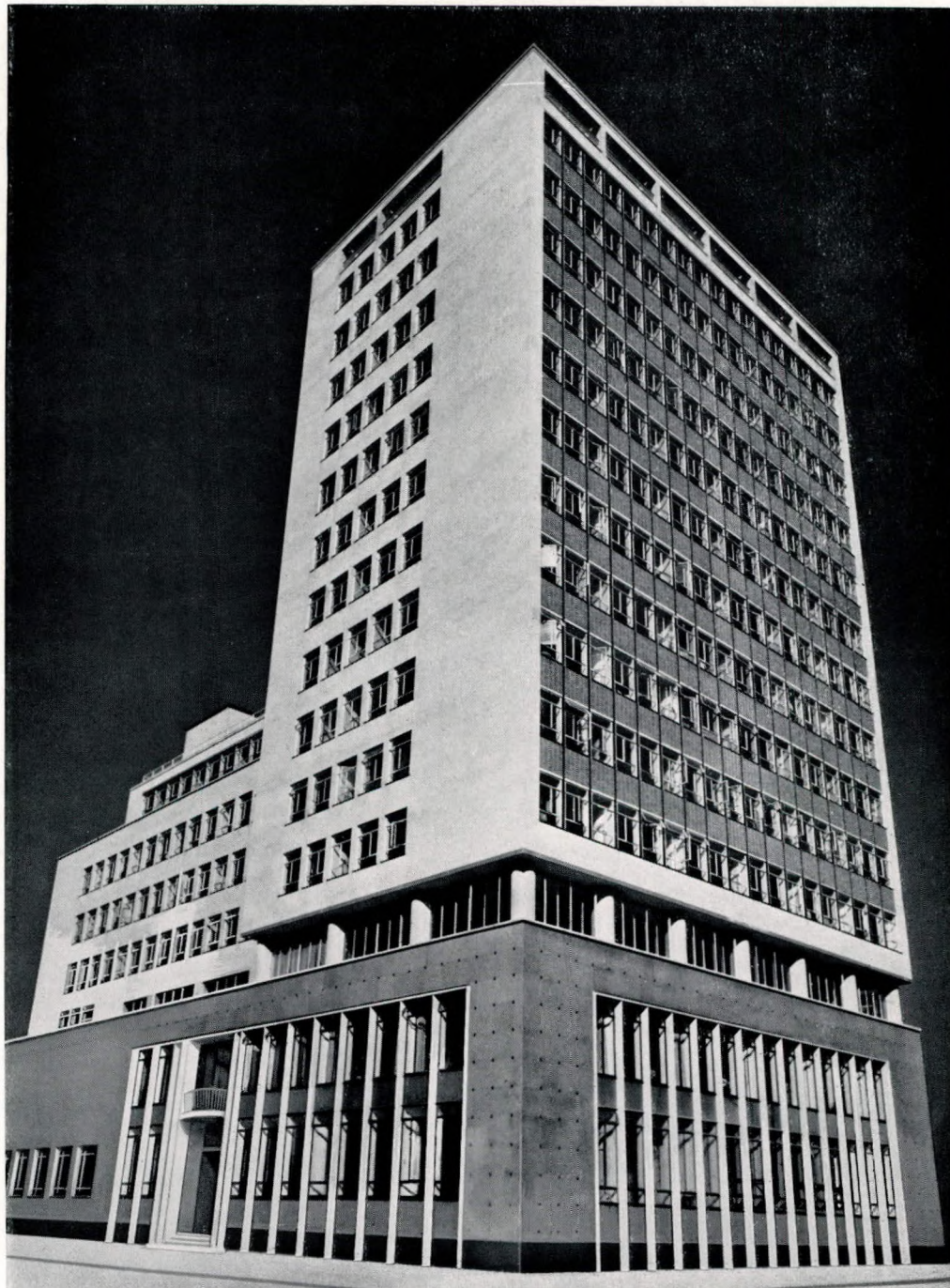
The Memorial Building, showing the entrance in Mark Lane