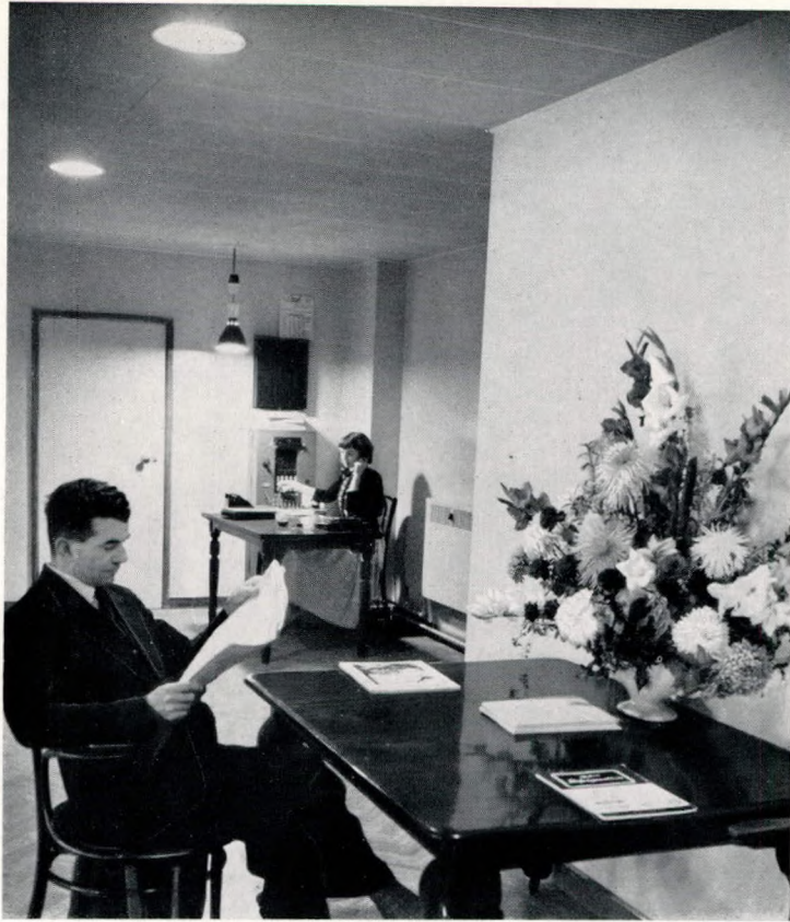
Reception Hall leading to the General Office