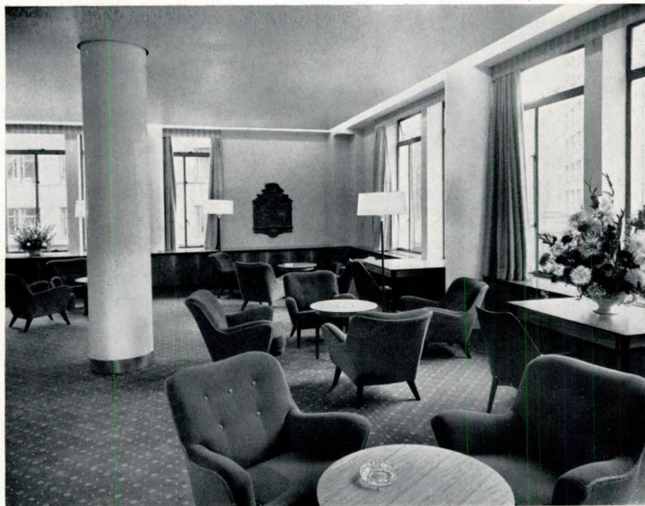
The Alfred Robertson Room: Members' Lounge