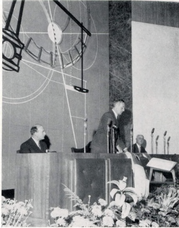
Lord Mountbatten unveiling the Memorial Book