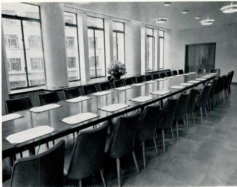
The Council Chamber