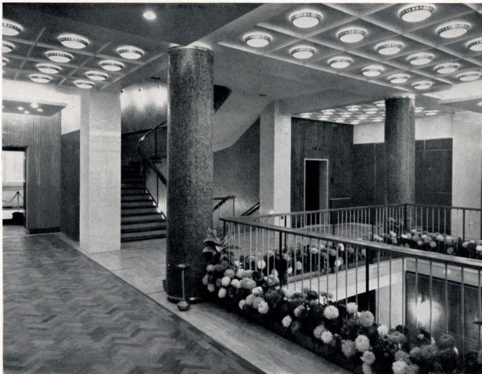
The foyer on the first floor