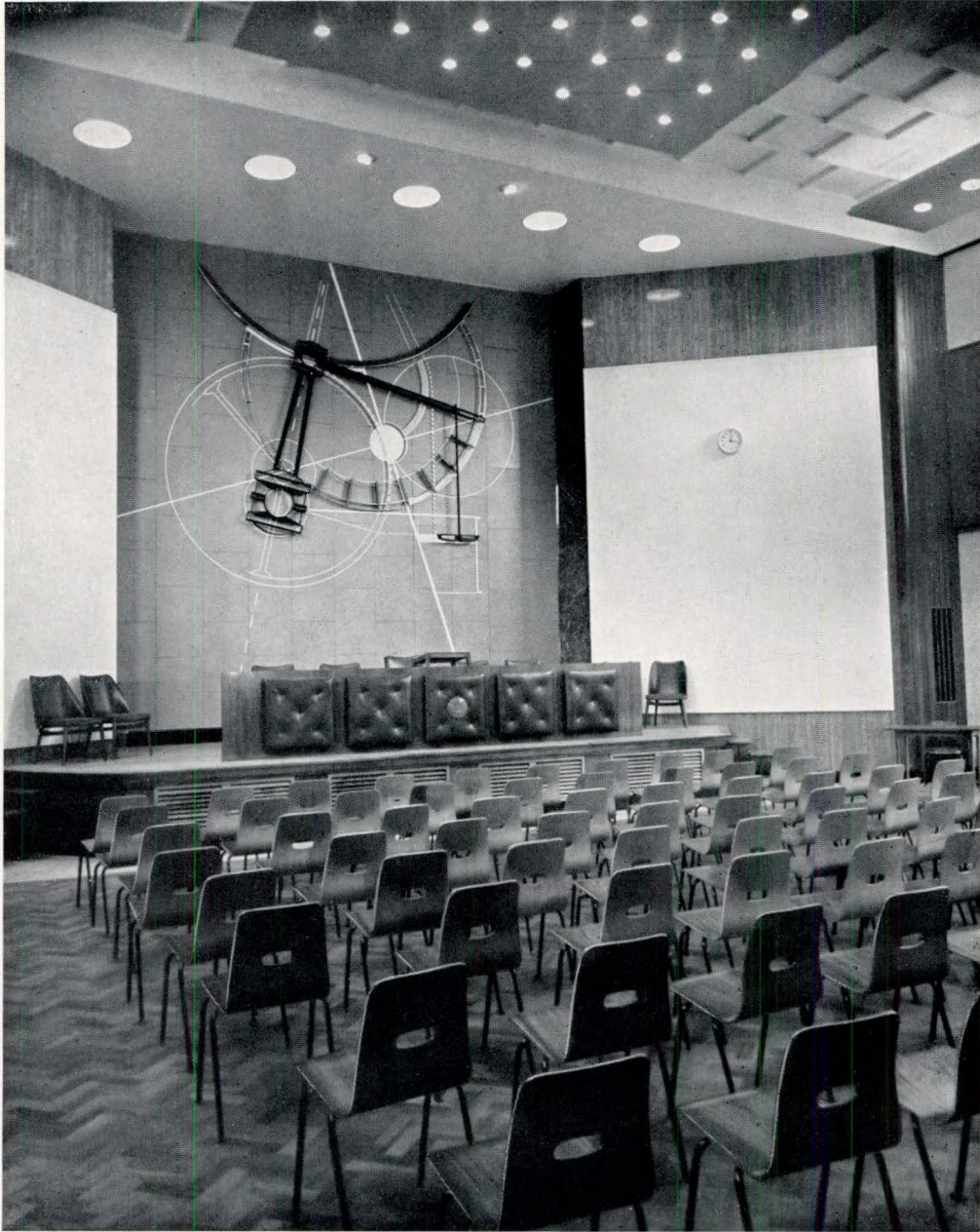
The Lecture Hall